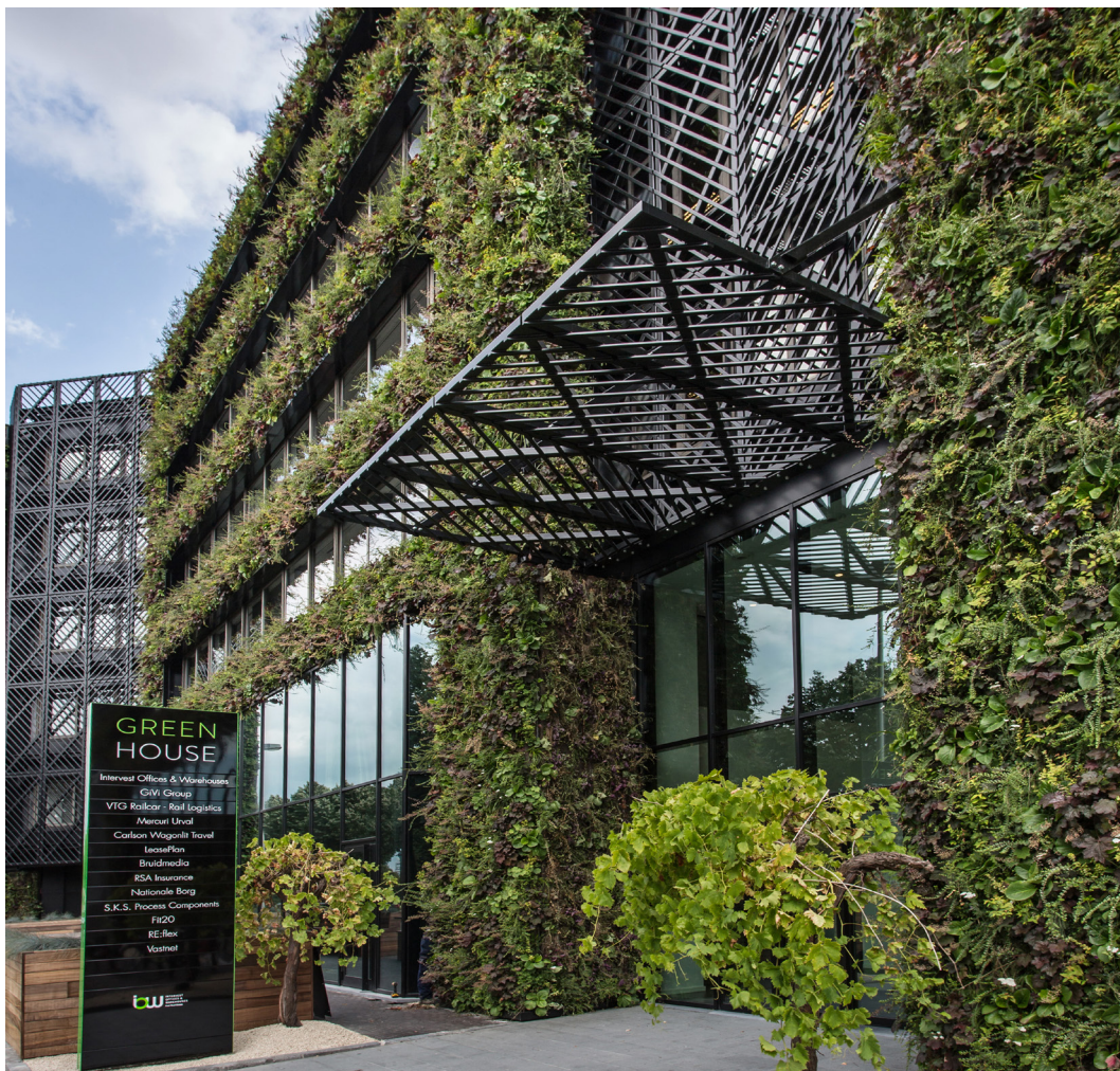
▲ Greenhouse Antwerp, green façade containing 50.000 live plants

Today, Flemish Minister Philippe Muyters and Councilman Rob Van de Velde officially inaugurate Greenhouse Antwerp. Greenhouse Antwerp is Intervest's innovative, recently renovated office building. The eye-catcher is the green façade, and with 50.000 living plants it has one of the largest such façades on any office building in Belgium. This initiative perfectly fits into the City of Antwerp's Green Singel project.