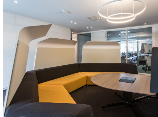
▲ RE:flex Berchem, inspiring discussion space

“Our integrated team of specialists is ready and waiting to help our customers completely (re)design their office spaces. This includes planning, budgeting, and the follow-up of works within the proposed timing. During the renovation and redesign of this building all customers were able to continue with their activities, and many of them made use of these turn-key solutions.”