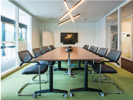
▲ RE:flex Berchem, trendy meeting room

Intervest significantly contributes to the 'Green Singel' with green façade containing 50.000 live plants