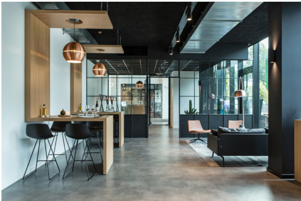
▲ Greenhouse Café for breakfast, lunch and catering for meetings

The redesign was handled by Intervest's own team of interior architects. Within the offices market Intervest positions itself not just as a lessor of square metres; it also provides a wide range of services and facilities, including turn-key solutions. Intervest has also set up a restaurant in the building, the Greenhouse Café, which is completely styled to match the renovation and exploited by Cook & Style.