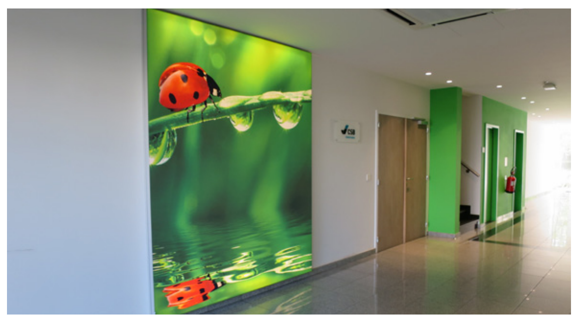
Intercity Business Park, Mechelen