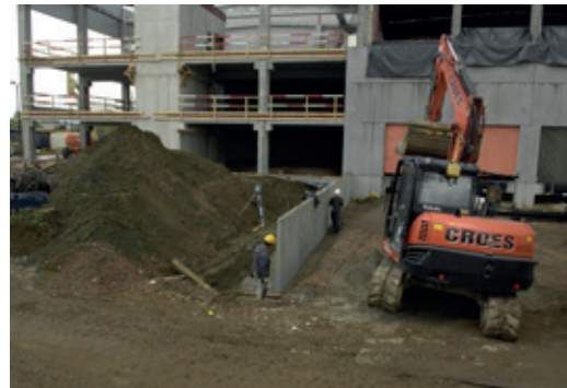
▲ Herentals Logistics 3 - construction works on schedule