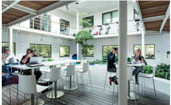
▲ Intercity Business Park - Biocartis