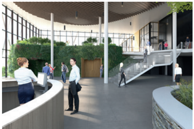
▲ Greenhouse BXL - artist impression