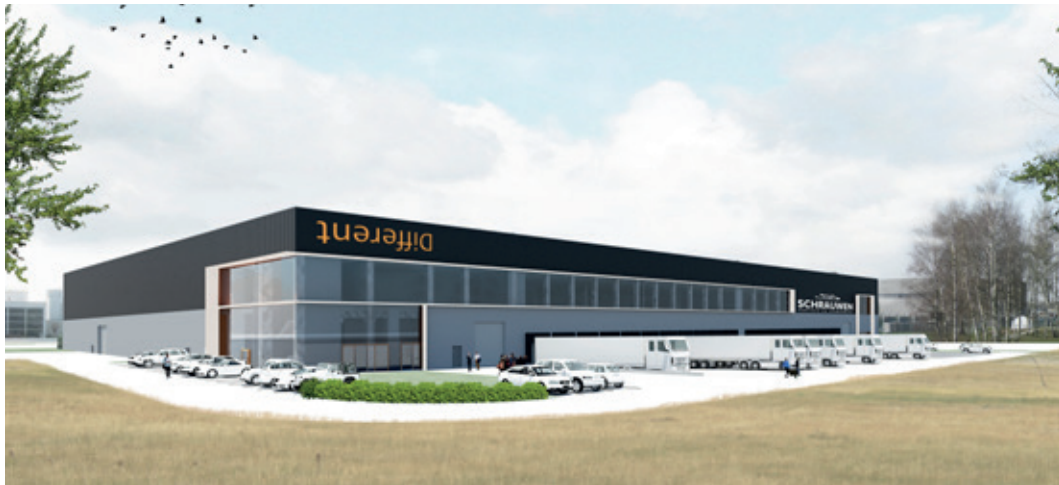
▲ Herentals Logistics 3 - artist impression

The project is scheduled for commissioning in the second quarter of 2017, entirely according to plan, and will generate rental income from that point.