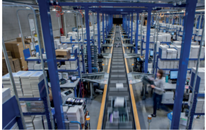
▲ Liège, CooperVision

Investments in the office market will be made more opportunistically. This was the case in 2016, when Intervest purchased two buildings in Mechelen to plan ahead for possible customer growth and, in this way, create the possibility of providing its existing customers with appropriate facilities in the longer term. Investments in the office market where the buildings and locations are coordinated with an inspiring and unique working environment, and which have a special character with regard to multi-functionality, architecture, sustainability and quality, will definitely be examined.