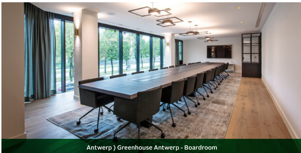
Antwerp ) Greenhouse Antwerp - Boardroom

The full agenda and all accompanying documents for the general meeting are available at www.interinvest.eu , under Investors/Shareholder information/Shareholders' meeting .