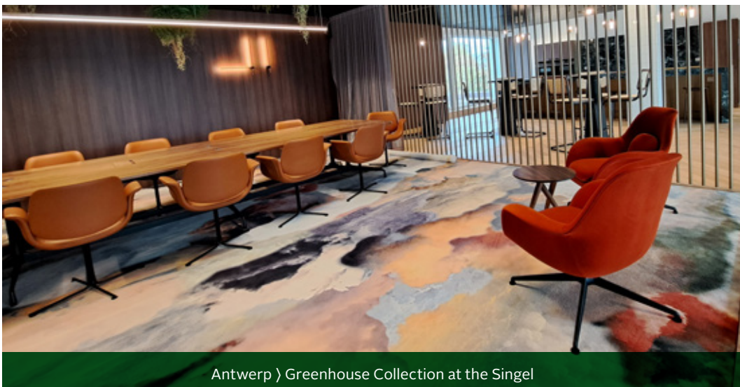
Antwerp › Greenhouse Collection at the Singel